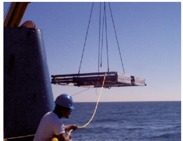
EQUATORIAL GUINEA Expanding sled ships and deploys 12' x 8' and measures 40' on bottom