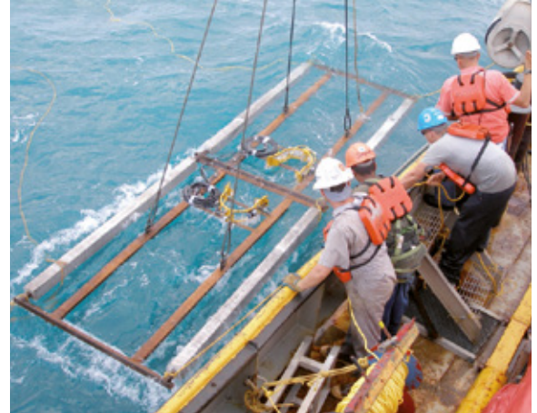
GULF OF MEXICO RetroSled with two clamps being overboarded