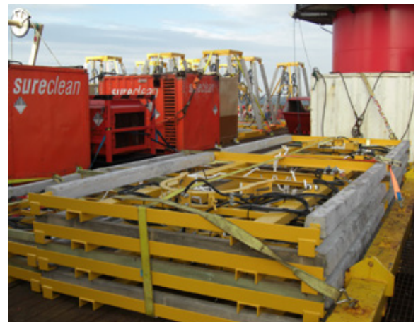
NORTH SEA RetroSled aboard a vessel bound to retrofit the Forties infield flowlines